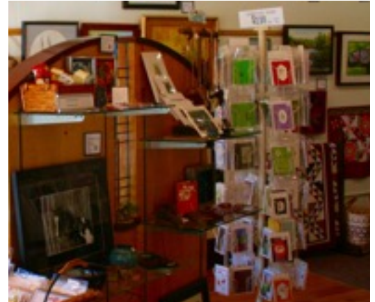
Art abounds in Arts in Hand Gallery