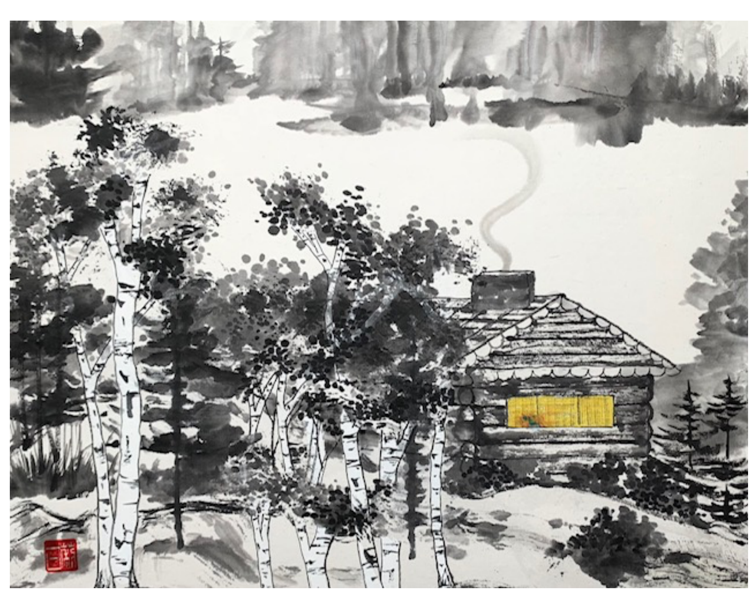
Gail Threinen, Chinese Brush Painting